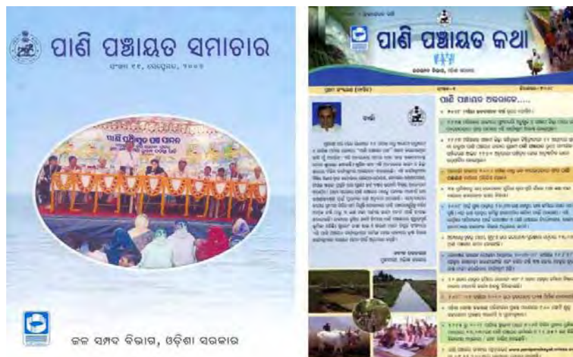
Figure 2: PP magazine and newsletter

The Water and Land Management Institution (WALMI) is in charge of capacity-building and is involved in inter-state dialogue and knowledge-sharing.